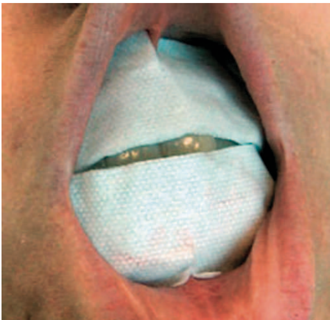
Figure 2. Nonadherent pad in position. Note slits at the midpoint of the superior and inferior margins to accommodate the frenula of the lips and the lateral slit in the middle so that the patient can breathe or speak while the anesthetic is in place.